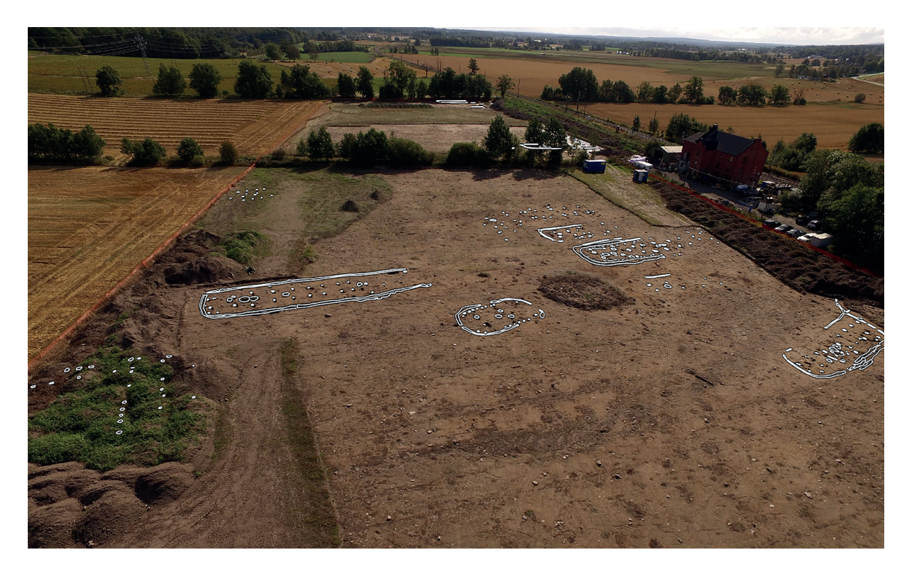
Figure 1. Settlement traces and their spatial distribution at Dilling, Moss, Southeast Norway. Illustration: Jan Kristian Hellan; Museum of Cultural History, University of Oslo.

At the outset, we highlight four aspects which characterize settlement archaeological research in Scandinavia today. First, differences in research traditions have contributed to notions of differing developments in settlement organizations within the Scandinavian countries. Second, differences in terminology between languages regarding settlement organization, particularly the words in Scandinavian languages for single farms and villages, contribute to different interpretations between national research traditions. Third, settlement organization differs between regions and periods rather than between the later national borders. Lastly, methodological developments contribute to increasingly rapid developments in results and interpretations, and open for a broadening range of opportunities in the years to come. The discussion of these four aspects, which forms the first part of this introduction, prepares the ground for our presentations of the contributions to the volume.