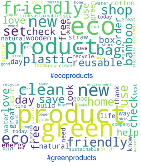
Fig. 3. Word clouds for tweet categories.