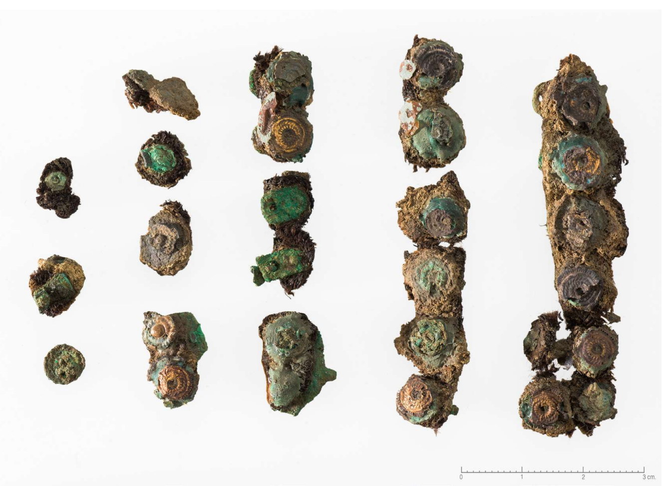
Figure 1. The set of clasps from Østabø. Top left: Drawing by Helliesen (1900, fig. 3). Top right: Drawing by Blindheim (1946, fig. 1). Bottom:

Unlike Hines, Blindheim dated the grave find from Østabø to the 4<sup>th</sup> century. Together with another set of clasps from Jødestad in Sandnes, Rogaland (which she had not herself observed, and which is actually somewhat younger), she