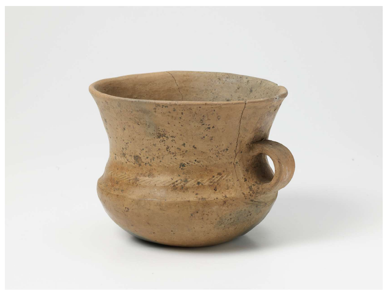
Figure 2. The handled vessel from Østabø.

The date of the grave find relies on the most diagnostic artefacts – the clasps, the handled vessel, and the brooch. Recognising the Late Roman Period style of the clasp buttons,